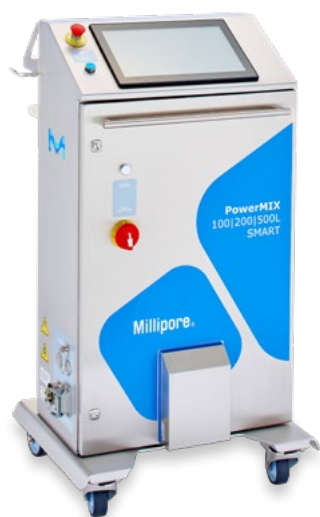
Figure 1. Smart control box

Recipe-driven automation eliminates manual operations, increases reproducibility, and minimizes risk of errors. Reports can be easily generated from scratch or from pre-defined templates. An interactive P&ID allows users to visually monitor the process and control each of the components from the Human-Machine Interface (HMI) or from anywhere through a browser-based interface.