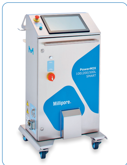
Figure 1. Smart control box.

Recipe-driven automation eliminates manual operations, increases reproducibility, and minimizes risk of errors. Reports can be easily generated from scratch or from pre-defined templates. An interactive P&ID allows users to visually monitor the process and control each of the components from the Human-Machine Interface (HMI) or from anywhere through a browser-based interface.