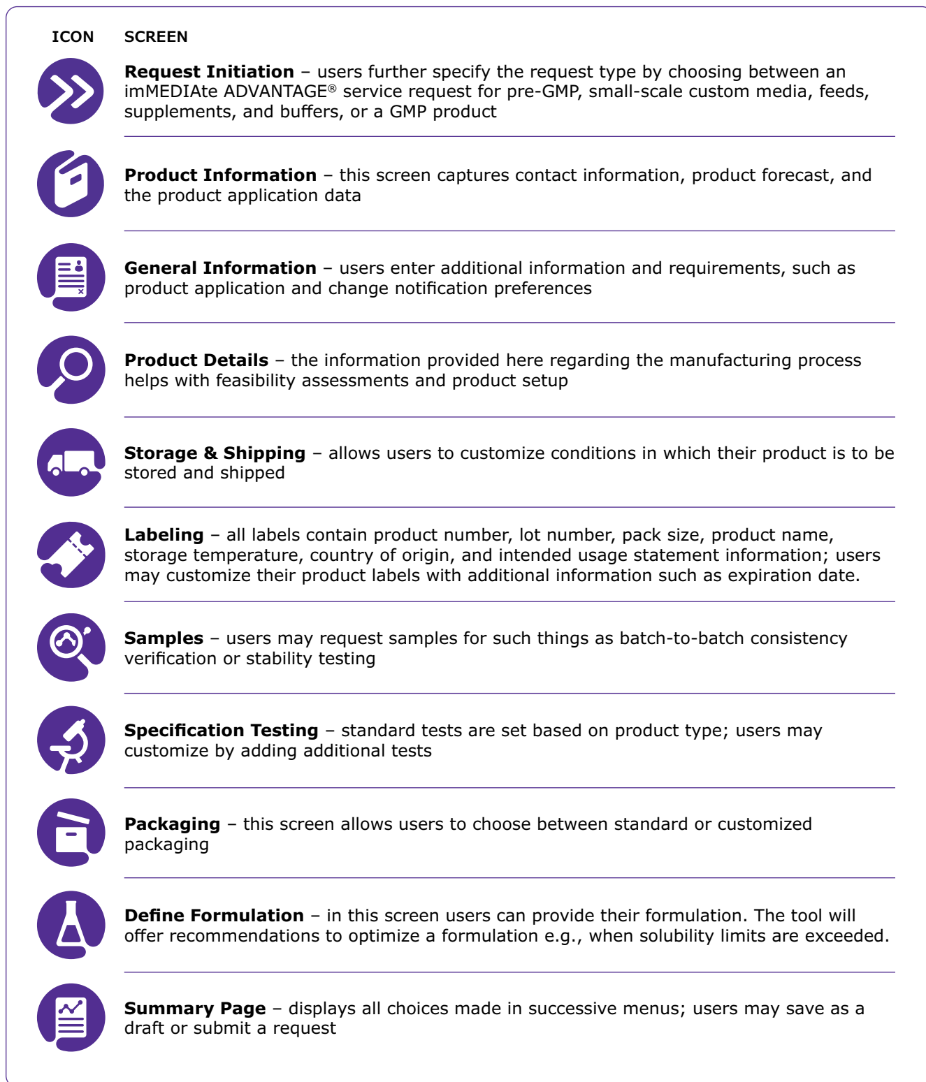
Table 1: Menu options displayed change based on product type