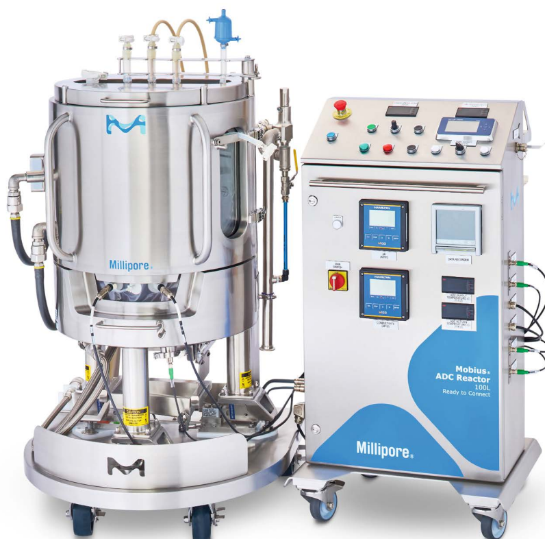
100 L Mobius® ADC Reactor with Ready to Connect Control Box.

The Mobius® ADC Reactor can be monitored and controlled locally or remotely. Plug the ready to connect control box to the network and use Ethernet IP communication protocol to monitor speed, weight, temperature, pH and conductivity remotely. The ready to connect control box is a separate box on a four wheels chassis that can be easily moved around the Mobius® ADC Reactor carrier. The 21 CFR Part 11 compliant data recorder option displays data trends in real time and ensures process data integrity when recording.