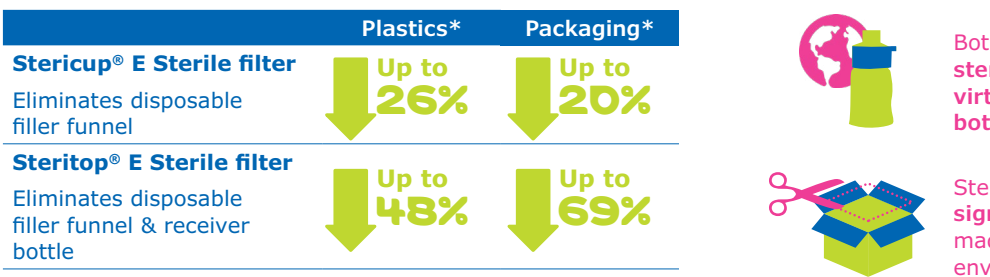
Both Stericup<sup>®</sup> E and Steritop<sup>®</sup> E sterile filters thread directly onto virtually any commercial media bottle or glass bottle