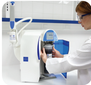
Quantum® Polishing Cartridge