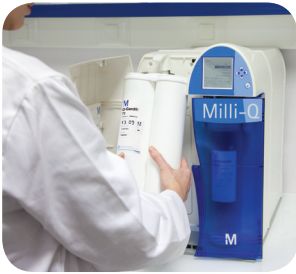
Q-Gard® Pretreatment Pack

The service program portfolio covers all maintenance requirements such as installation, customized user training, scientific and technical support, troubleshooting, preventive maintenance visits, and all validation requirements using ad hoc calibrated equipment, procedures, workbooks and suitability tests within a GxP environment.