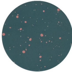
Rhodotorula mucilaginosa DSM 70403