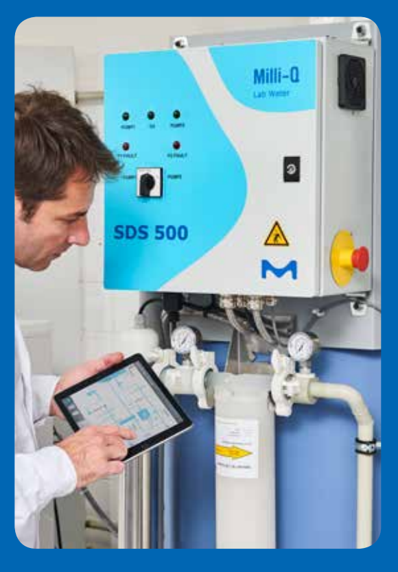
Lab technician checking SDS 500 parameters via an authorized iPad connection

Connectable to LIMS (Laboratory Information Management System) or BMS (Building Management System) via Milli-Q® HX or HR 7000 series system