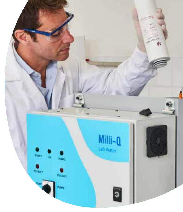
Lab technician changing SDS 500 vent filters