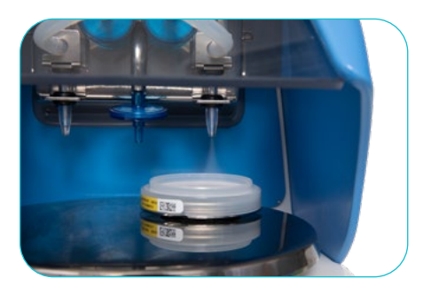
Figure 5: The AutoSpray Station applying reagent

Remove the membrane filter from the Milliflex Oasis® prefilled agar plates using the membrane removal tool and place the membrane filter on the Milliflex® Rapid 2.0 AutoSpray Station to apply the reagents. Both reagents are automatically sprayed across the membrane filter in quick succession.