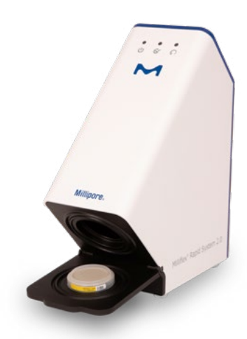
Figure 3: Milliflex® Rapid System 2.0 Detection Tower with Milliflex Oasis® membrane filter, ready for fast reading

only a short incubation period to generate enough ATP for detection and enumeration of microcolonies. The image analysis software intensifies the bioluminescence from each microcolony a thousand times and captures the light signals emitting from the microorganisms. The software enumerates the microcolonies and displays them on a computer screen.