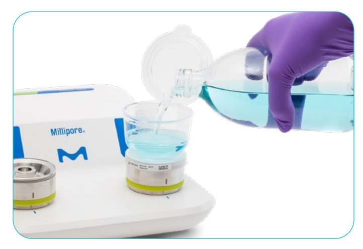
Figure 4: Filterable sample being poured into a Milliflex Oasis® filtration unit

Filter the desired sample volume through a presterilized, ready-to-use disposable Milliflex Oasis® filtration unit according to your standard operating procedure. The unit's unique Milliflex Protact® features allow for an easy and safe subsequent transfer of the membrane filter onto a Milliflex Oasis® agar plate for incubation.