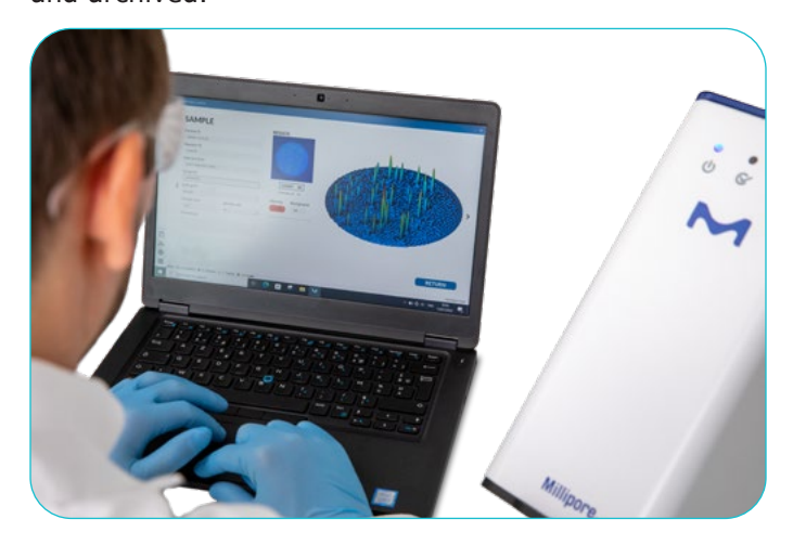
Figure 6: Computer-based result analysis with the 21 CFR Part 11 compliant Milliflex® Rapid 2.0 software.

Transfer the membrane filter to the Milliflex® Rapid System 2.0 Detection Tower for enumeration of microcolonies. Using the computer, enter sample information and run the test to count the microcolonies (reported in CFUs). An image of the membrane filter and its colonies is automatically recorded, displayed, and archived.