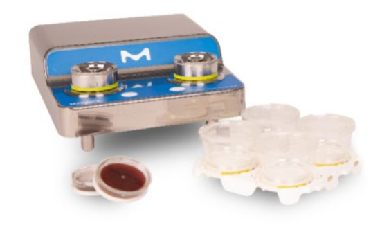
Figure 8: Milliflex Oasis® VHP resistant pump for use in a VHP isolator

Filtration of the samples is performed inside a sterility testing isolator using a Milliflex Oasis® VHP resistant pump and three sterile 0.45 \mu m pore size Milliflex Oasis® rapid filtration units. Incubation of the membrane filters on the ready-to-use media cassettes for rapid sterility testing takes place aerobically at 20 to 25 °C, 30 to 35 °C, or anaerobically at 30 to 35 °C, to grow any contaminants that may be present.