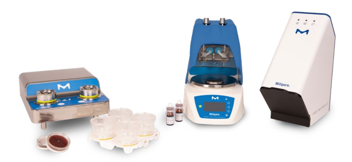
Figure 1: Components of the Milliflex® Rapid System 2.0 setup: Milliflex Oasis® VHP resistant pump with its consumables (left), Milliflex® Rapid AutoSpray Station (center), Milliflex® Rapid Detection Tower (right)

Based on highly sensitive adenosine triphosphate (ATP) bioluminescence technology, the Milliflex® Rapid System 2.0 delivers faster test results than traditional microbial contamination detection methods. Using Milliflex Oasis® sample preparation and filtration devices, the Milliflex® Rapid System 2.0 ensures consistent and reliable results. It can clearly distinguish between mixed microbial growth of slow-growing and fast-growing microorganisms, and cope with variances in colony size and ATP content.